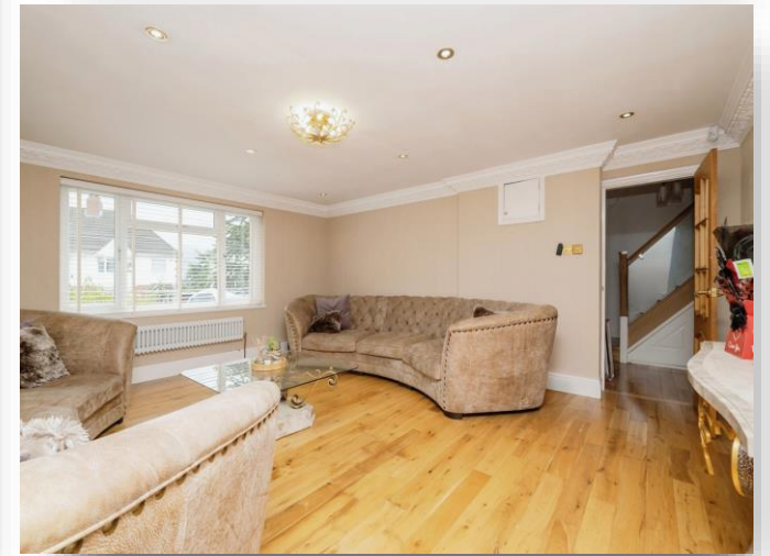
Gainsborough Road, Great Barr Birmingham B42 1NA