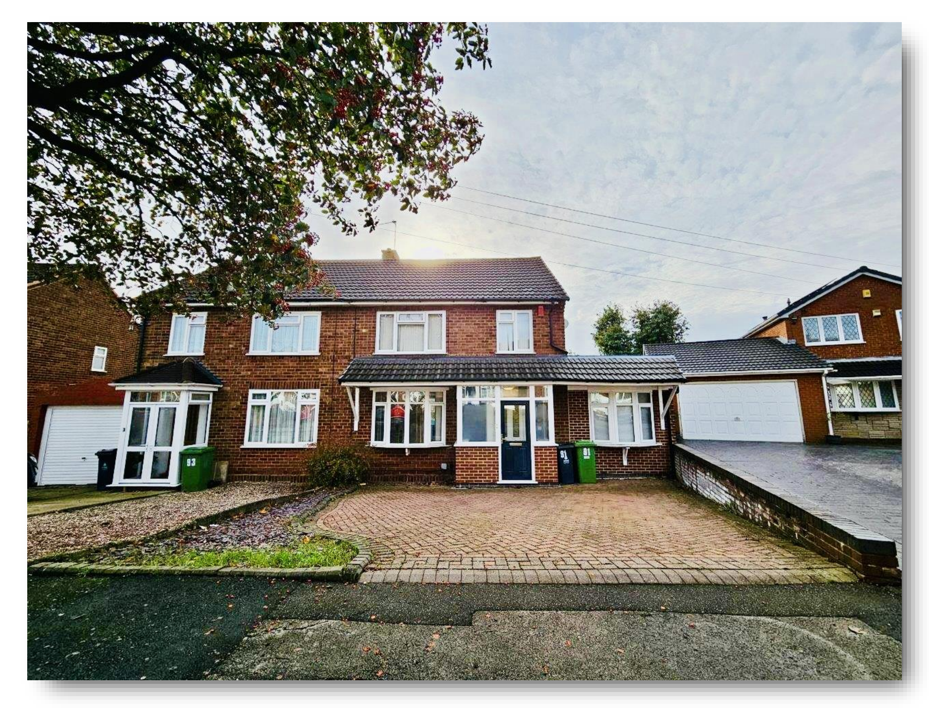
Gainsborough Crescent, BirminghamB43 7TR