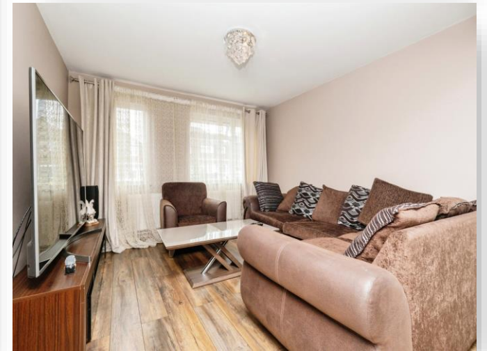
Eastwood Road, Great Barr Birmingham B43 5RP