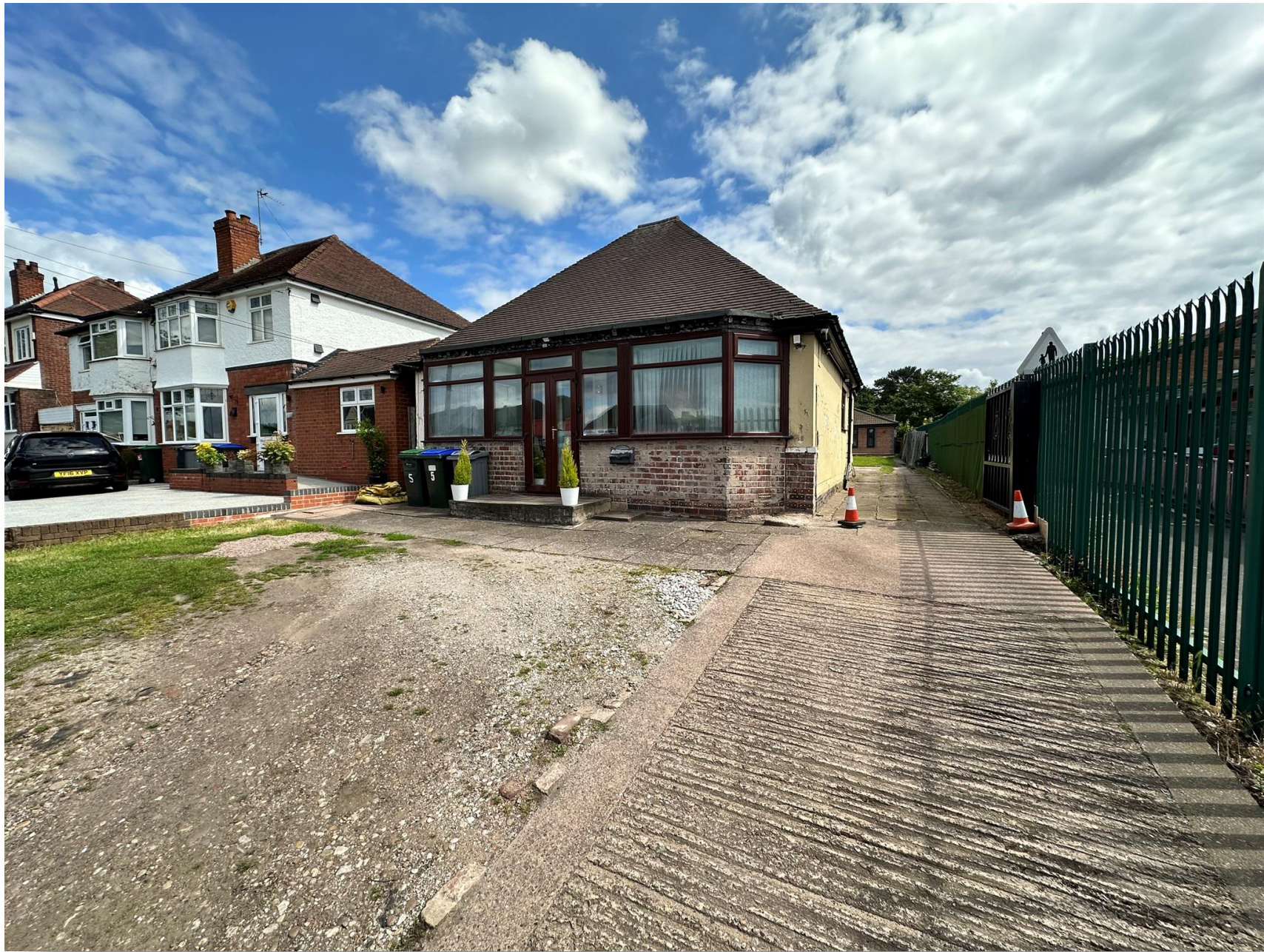
Birmingham Road, Great Barr Birmingham B43 6NW