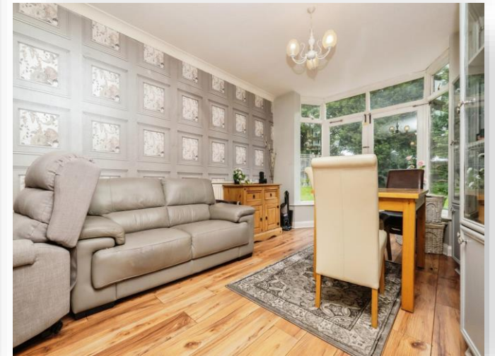
Kingstanding Road, Birmingham B44 9RJ