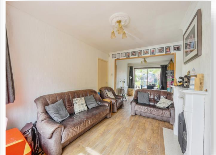
Sutton Oak Road, Sutton Coldfield B73 6TL