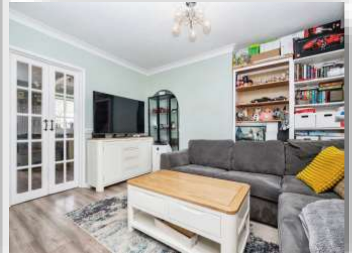
Tyndale Crescent, Birmingham B43 7NR