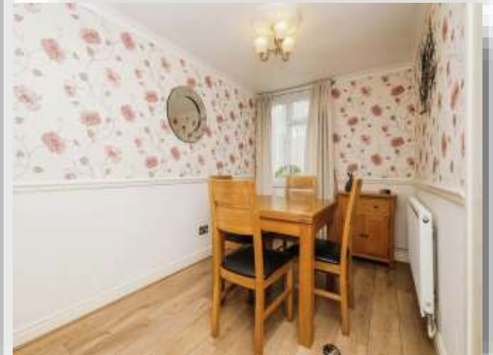
Brogden Close, West Bromwich B71 3SJ