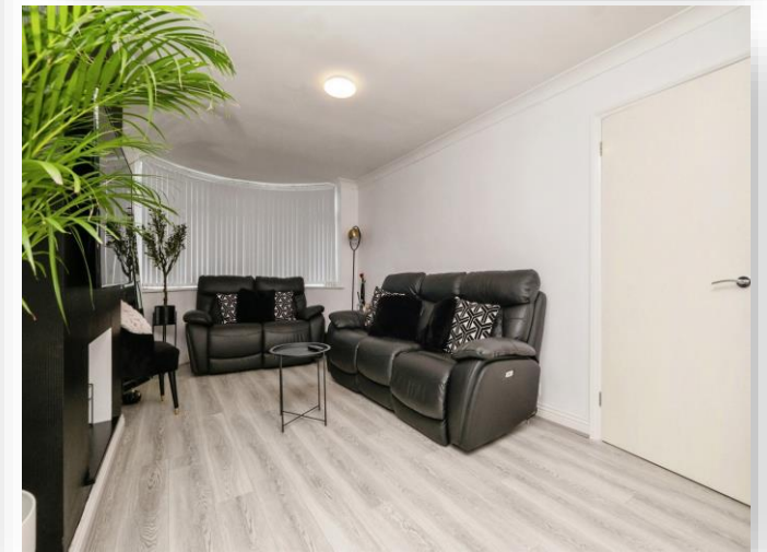
Aldridge Road, Great Barr BIRMINGHAM B44 8NP