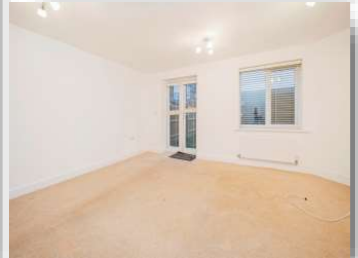
Perry Place, West Bromwich B70 0PE