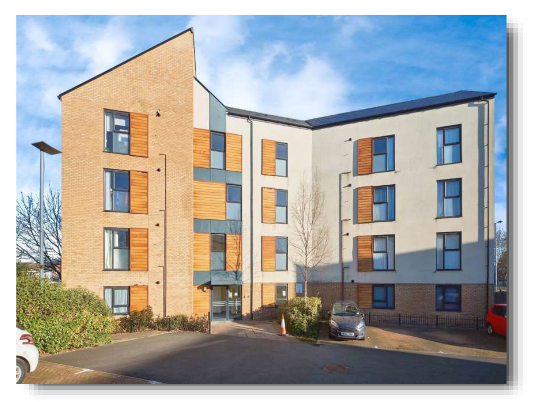
Flat 1 William Way, Birmingham B19 2LS