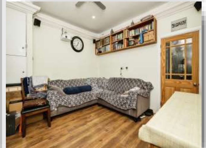
Carpenters Road, Birmingham B19 2BB