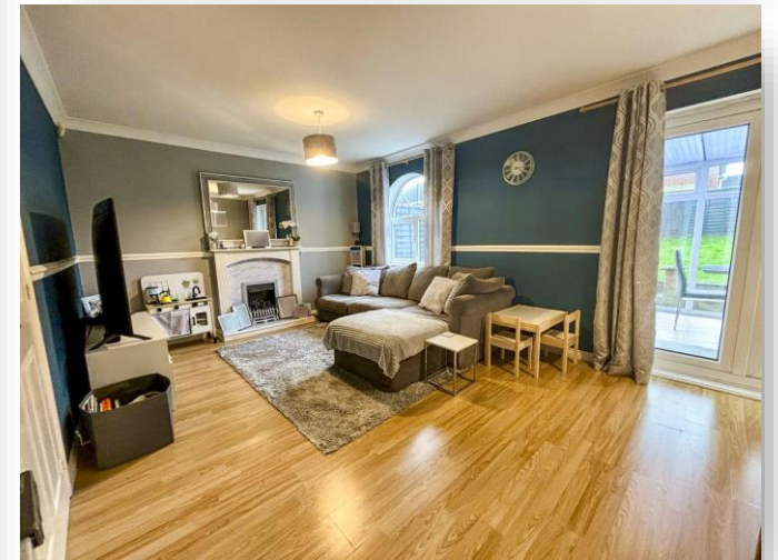
Brackendale Drive, Walsall WS5 4DA