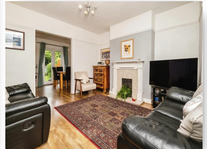
Bakers Lane, Sutton Coldfield B73 6XD