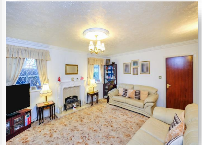
Pages Lane, Birmingham B43 6LL