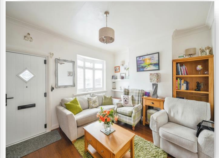
Gorsy Bank Road, Hockley Tamworth B77 5JD