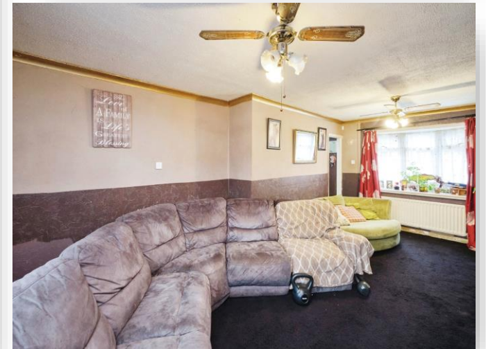
Campville Grove, Birmingham B37 6ER