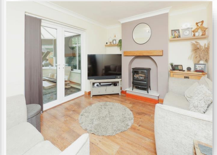
Woodford Avenue, Birmingham B36 9AU