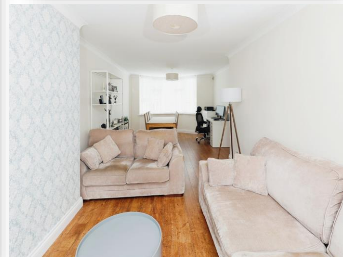
Springfield Road, Castle Bromwich BIRMINGHAM B36 0DU