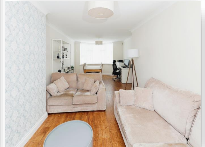
Springfield Road, Castle Bromwich BIRMINGHAM B36 0DU