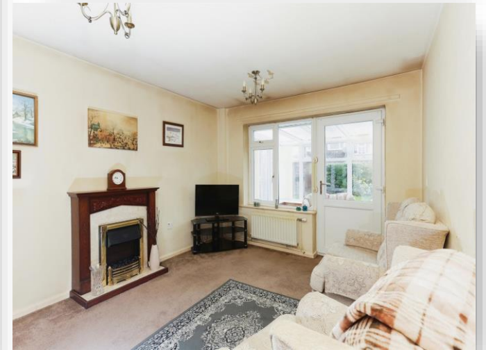
Wyegate Close, Birmingham B36 0TQ