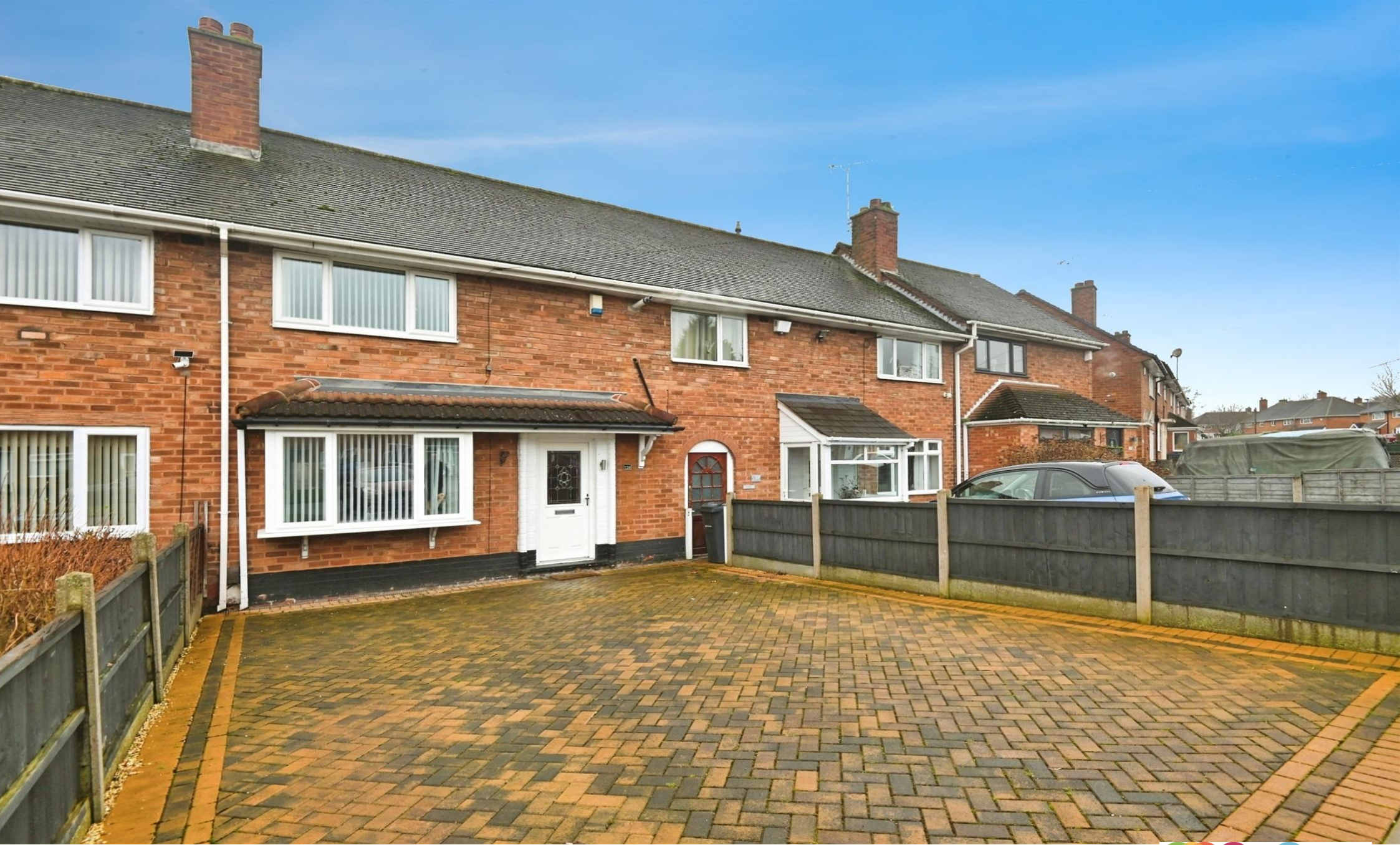
Longmeadow Crescent, Shard End Birmingham B34 7LB