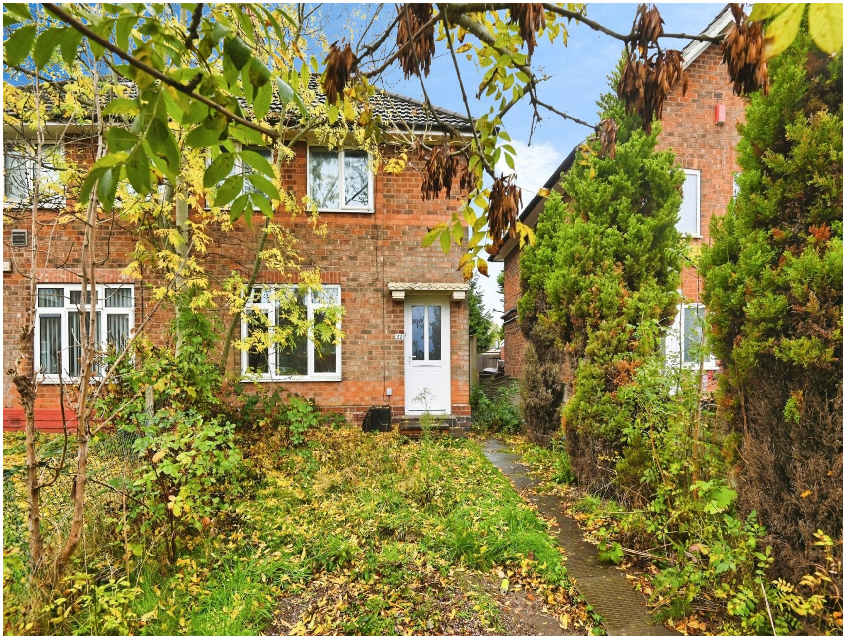
Betley Grove, Birmingham, B33 9NQ