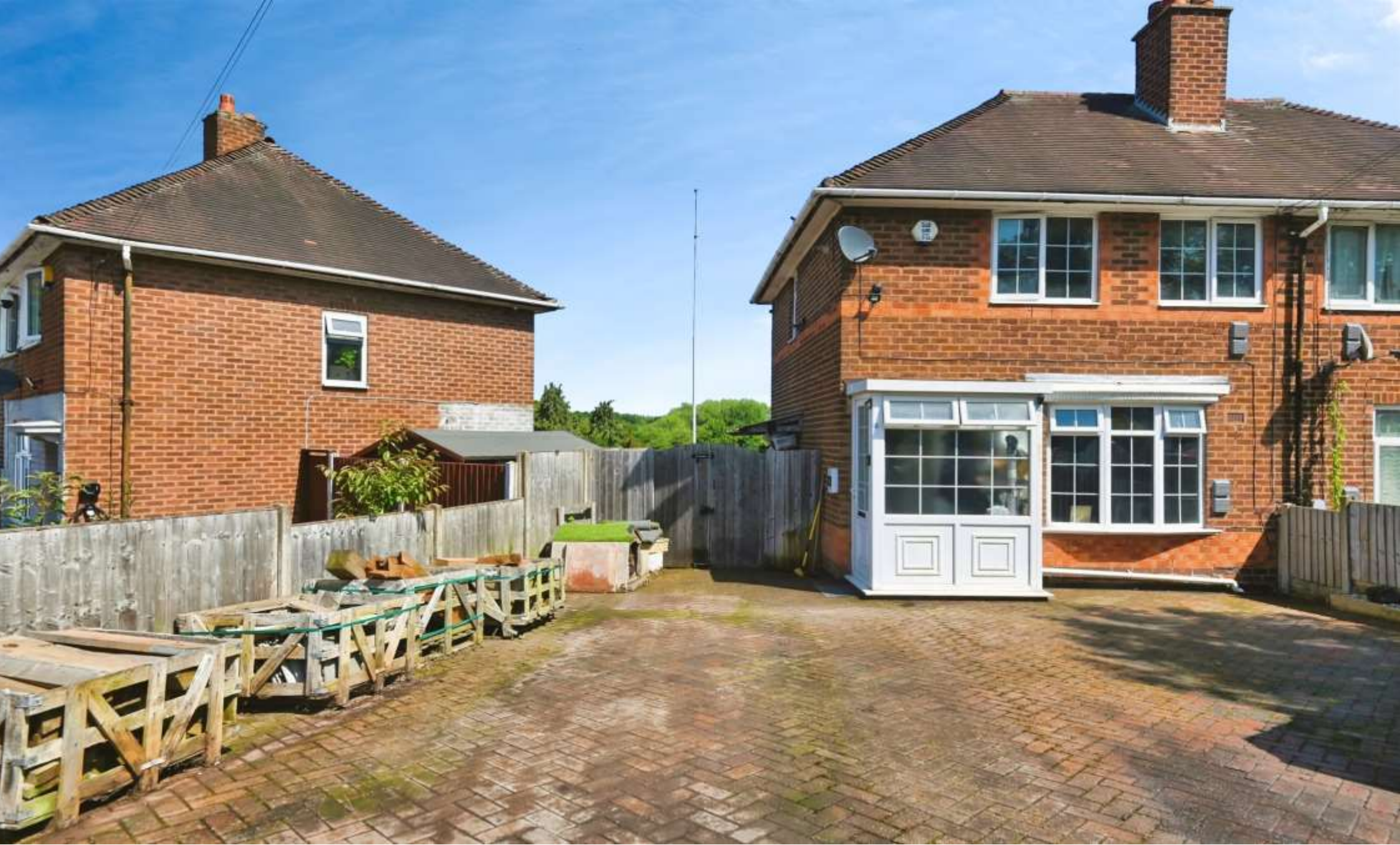
Netherton Grove, Birmingham B33 9TE

Not for marketing purposes INTERNAL USE ONLY