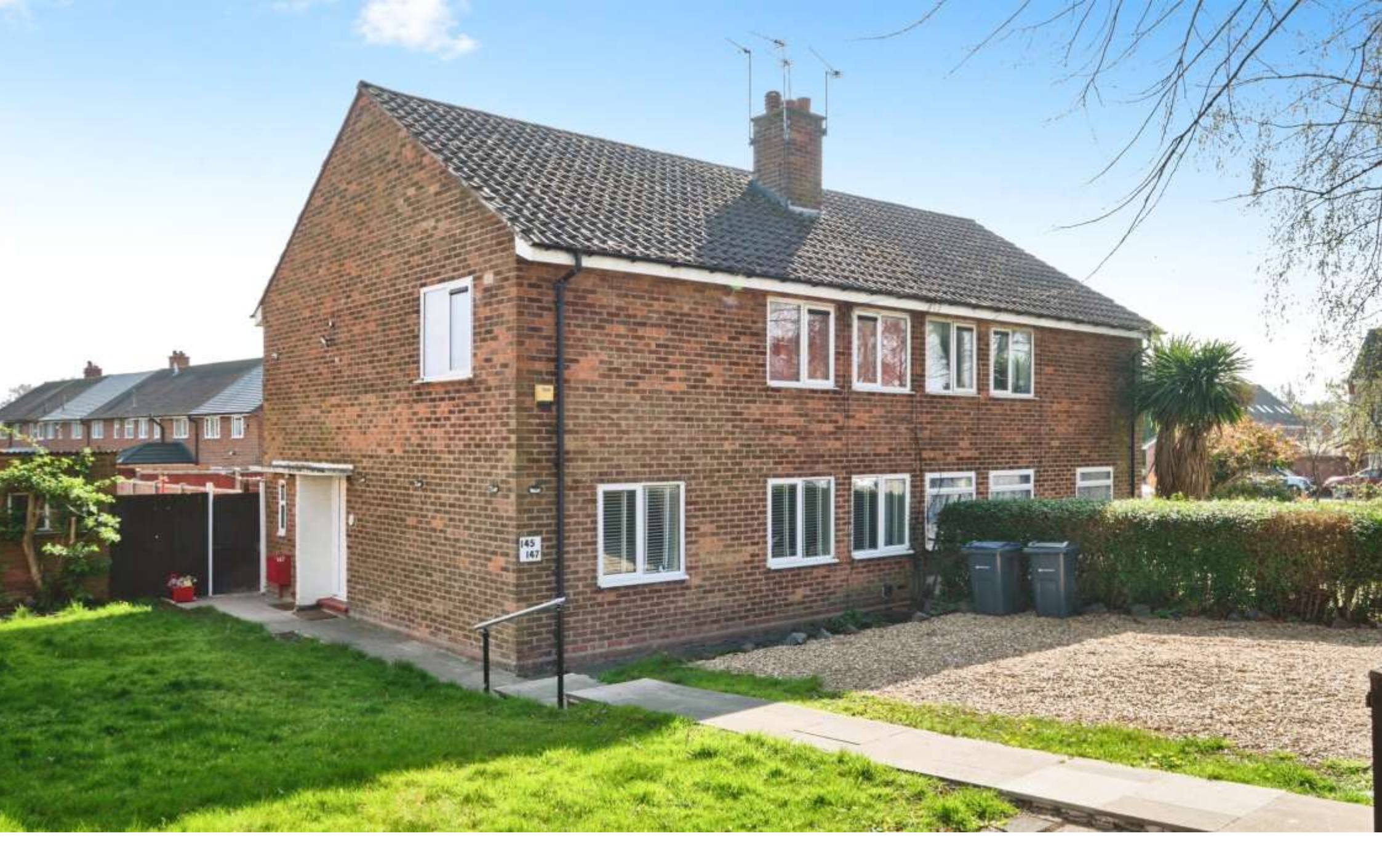
Freasley Road, Birmingham B34 7QL