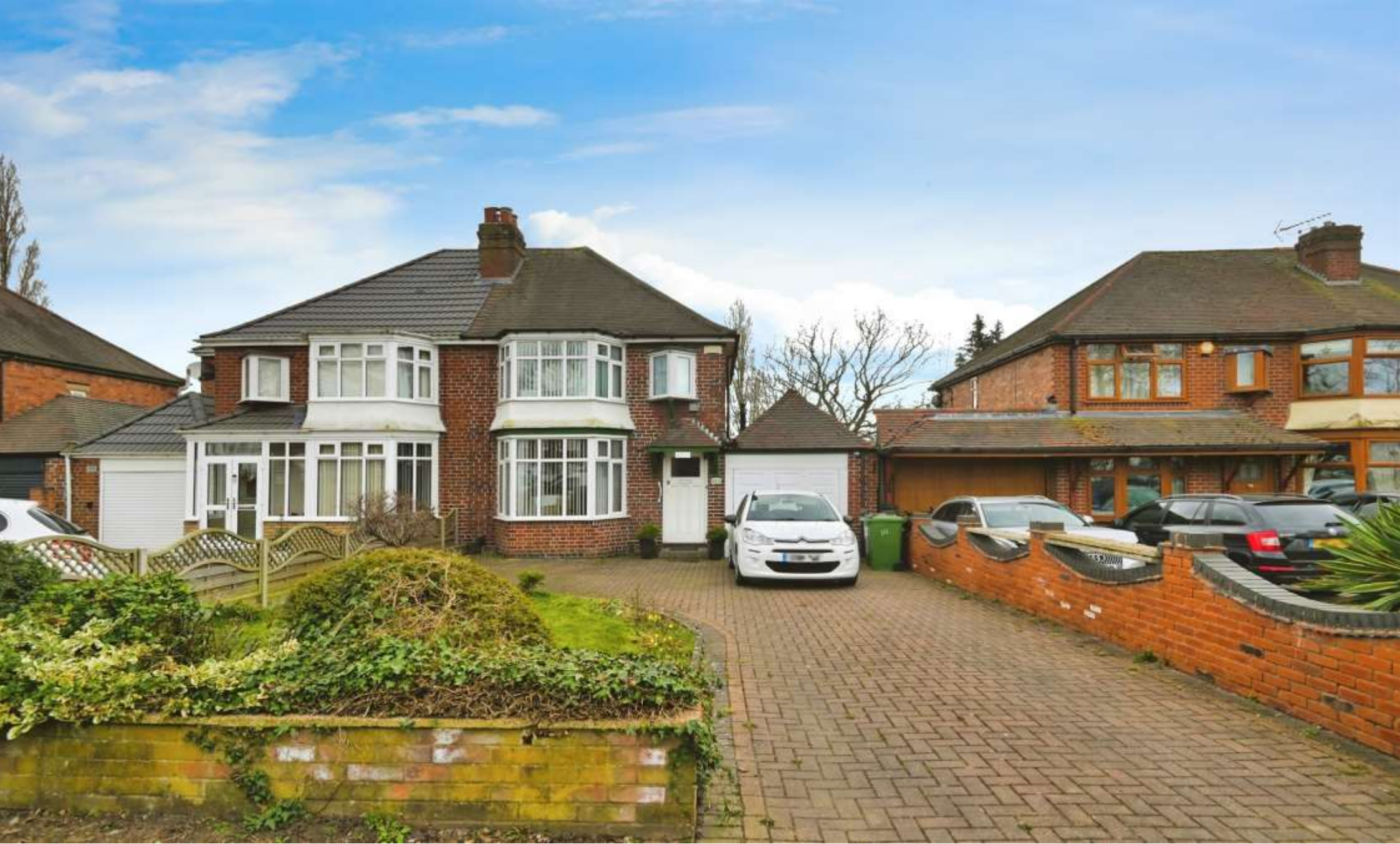
Chester Road, Castle Bromwich Birmingham B36 0LD

Not for marketing purposes INTERNAL USE ONLY