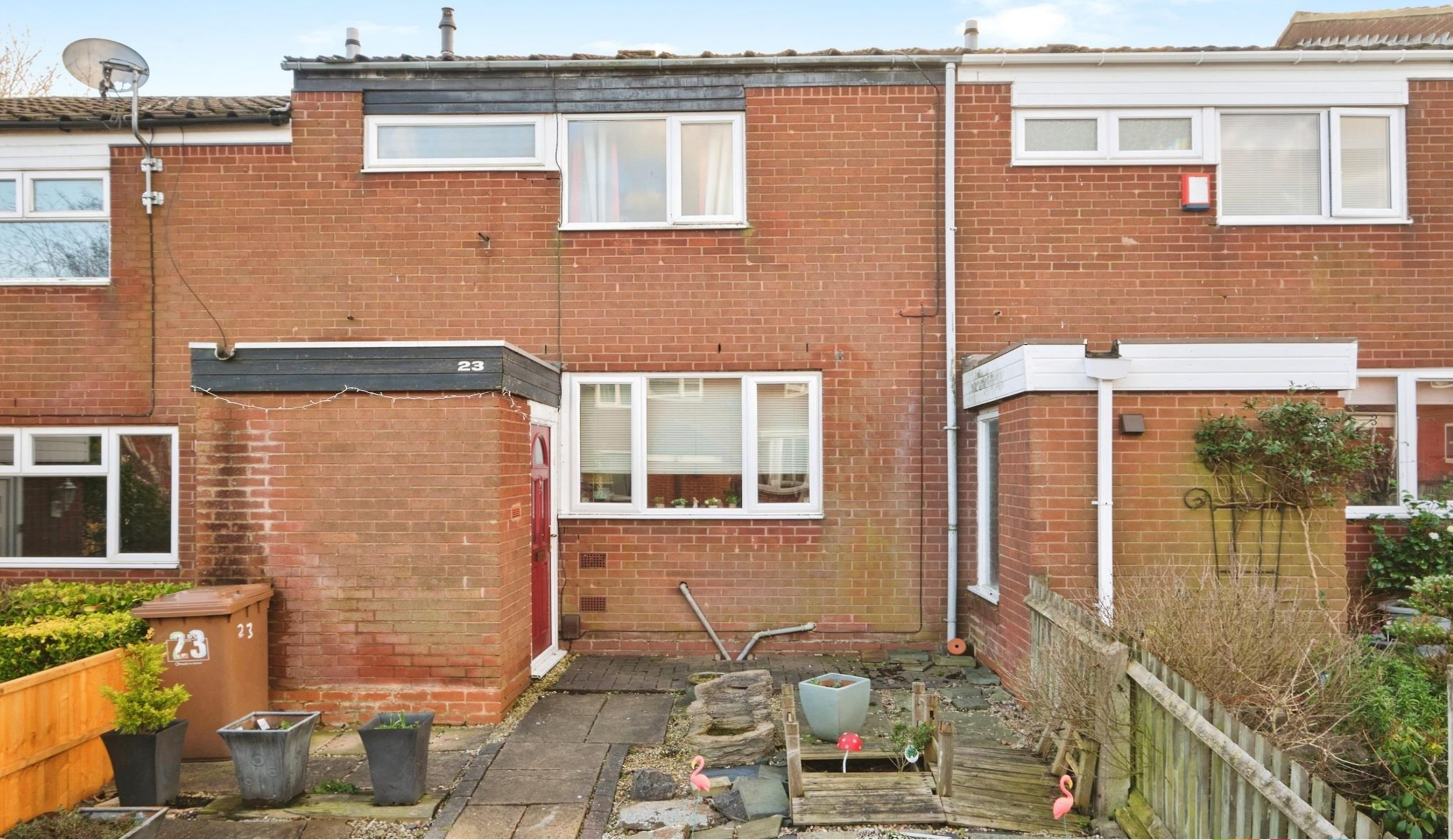
Austin Croft, Birmingham B36 9JJ