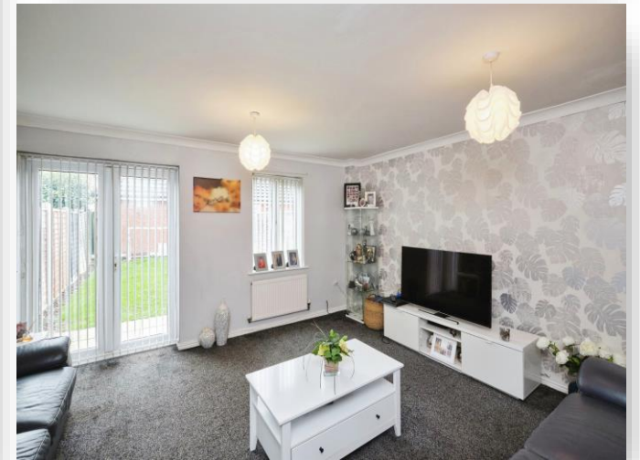
Kitegreen Close, Chelmsley Wood Birmingham B37 6UP