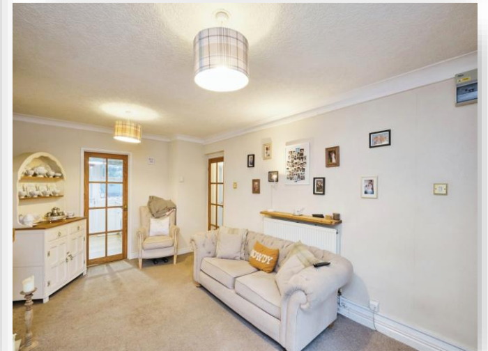
Finches End, Birmingham B34 6UD