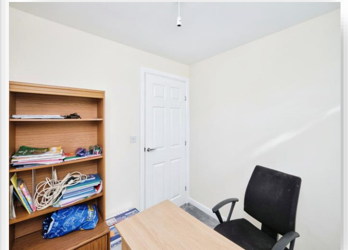
Jura Way, Birmingham B36 0QJ