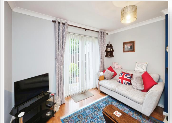
Meriden Drive, Birmingham B37 6BH