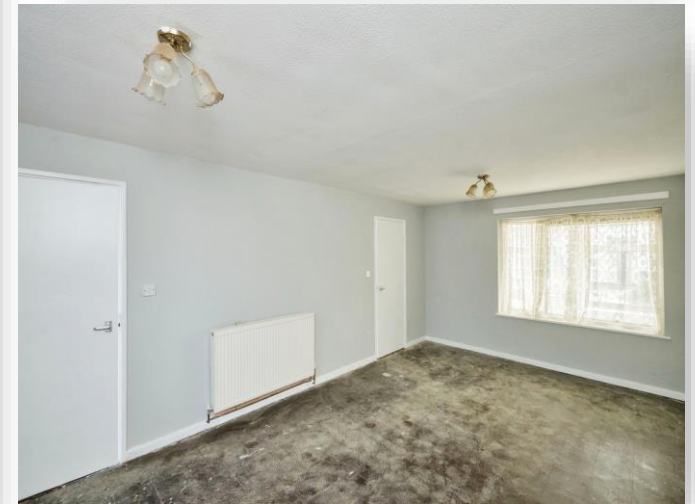
Corncrake Drive, Birmingham B36 0QU