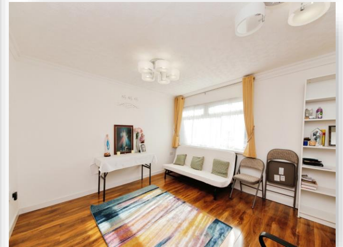
Dyce Close, Birmingham B35 6JX