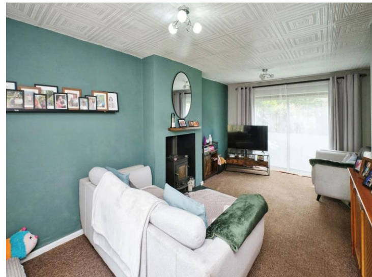
Meriden Drive, Birmingham B37 6BP