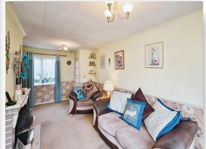
Cheltenham Drive, Birmingham B36 8QG