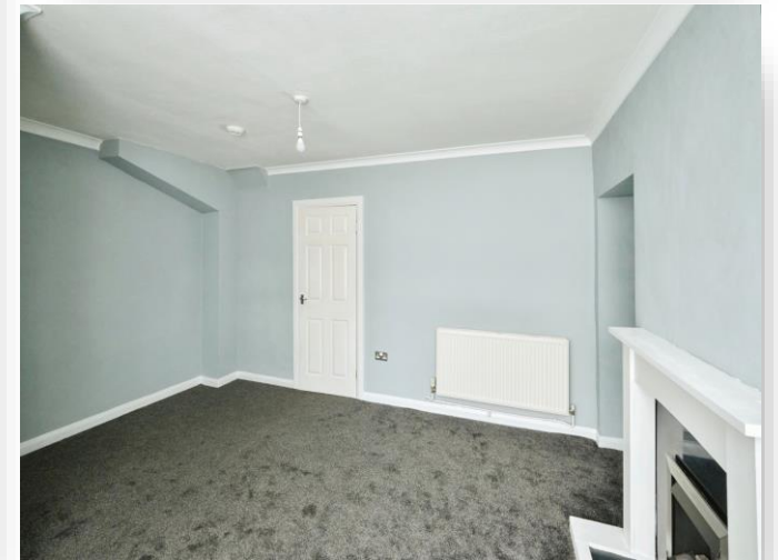
Round Road, Birmingham B24 9QY