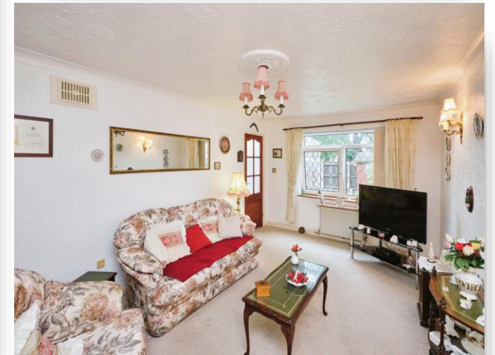
Coleshill Heath Road, Birmingham B37 7HX