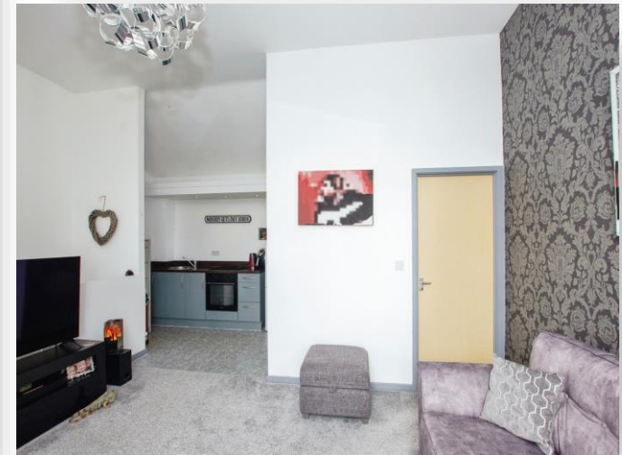
Merlin Way, Birmingham B35 6QN