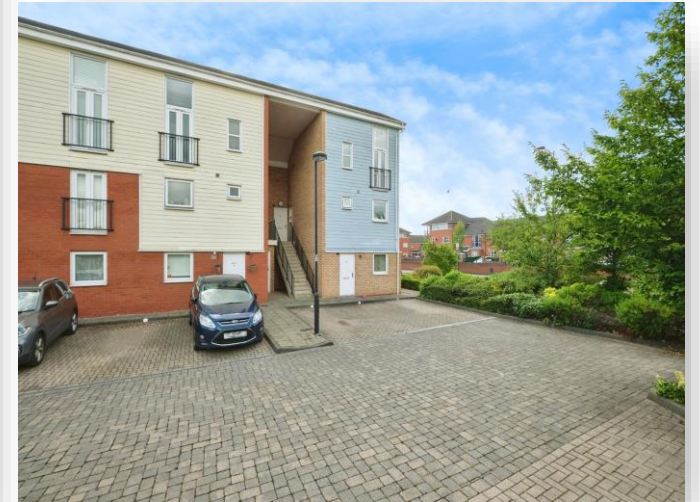
501a Yatesbury Avenue, Birmingham B35 6PU