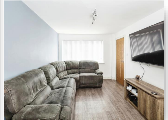
Morar Close, Birmingham B35 7PE