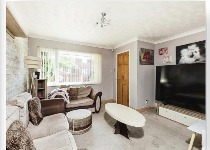
Orchard Meadow Walk, Birmingham B35 7LU