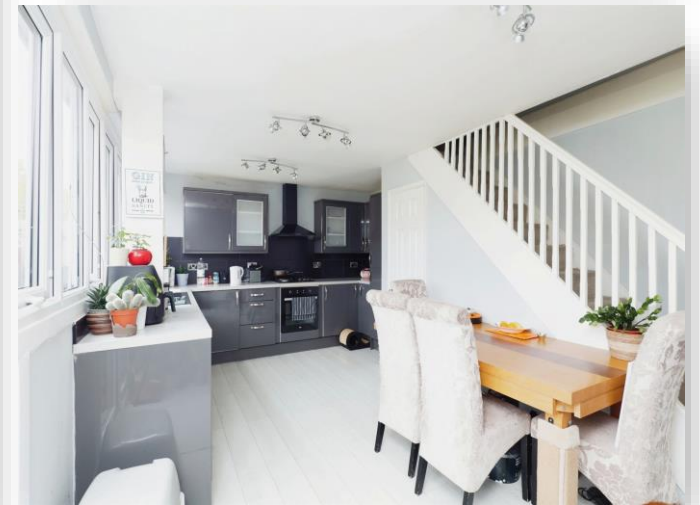
Innsworth Drive, Birmingham B35 6BB