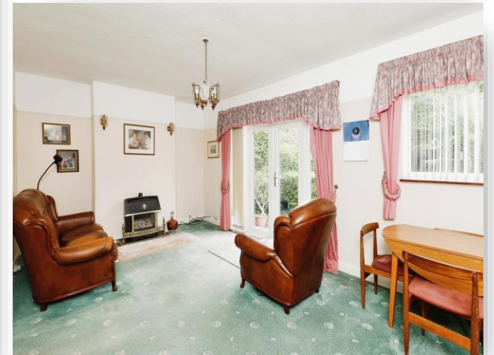
Heathland Avenue, Birmingham B34 6LR