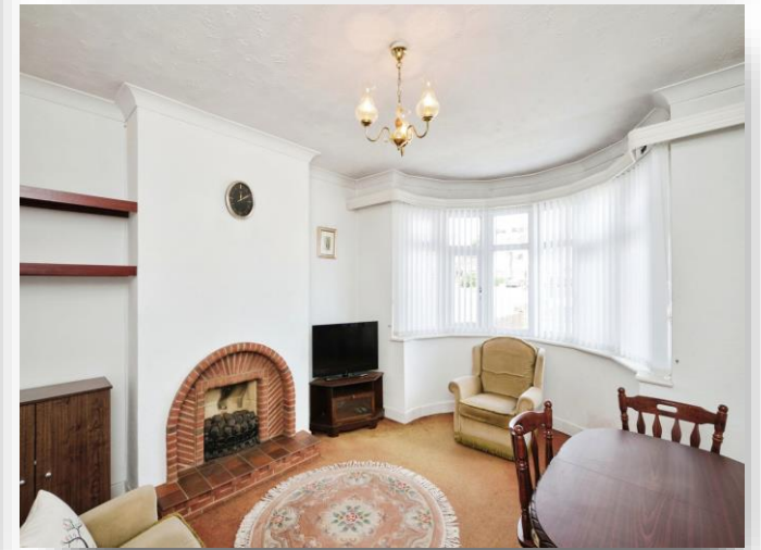
Chester Road, Castle Bromwich Birmingham B36 0JE