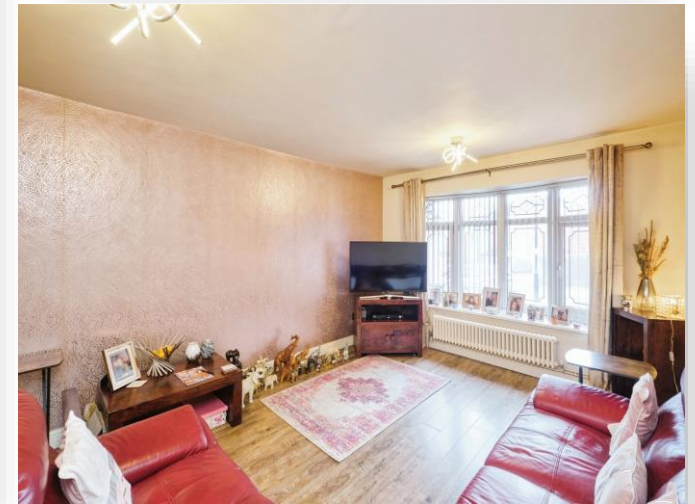
Middle Leaford, Birmingham B34 6HA