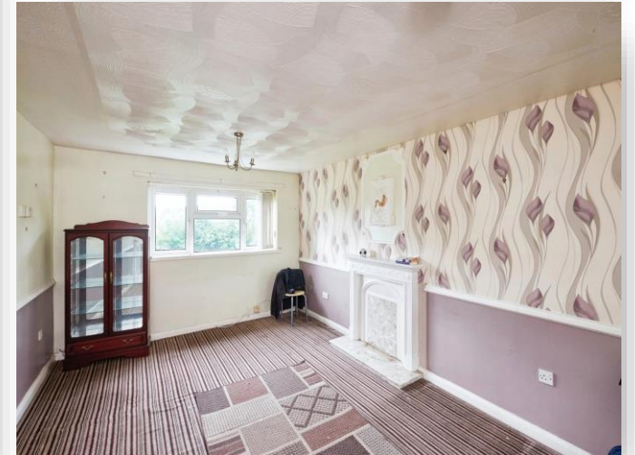
Kendrick Avenue, Birmingham B34 7SD