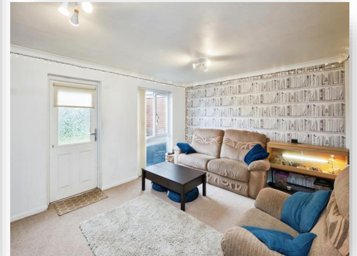
Forth Drive, Birmingham B37 6PR