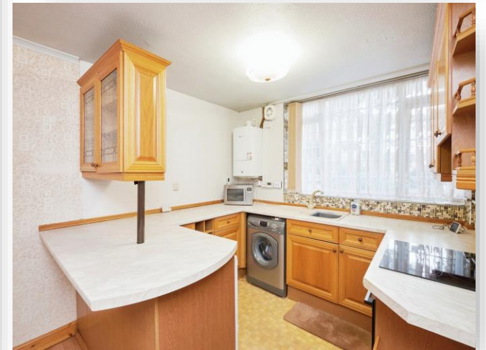
Pike Drive, Birmingham B37 7UL