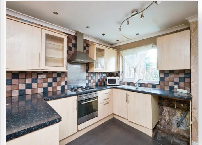
Trigo Croft, Birmingham B36 8SB