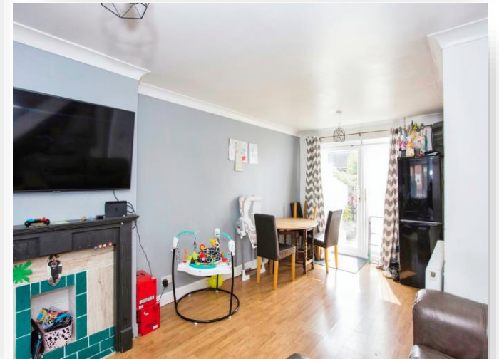
Kitsland Road, Birmingham B34 7NA